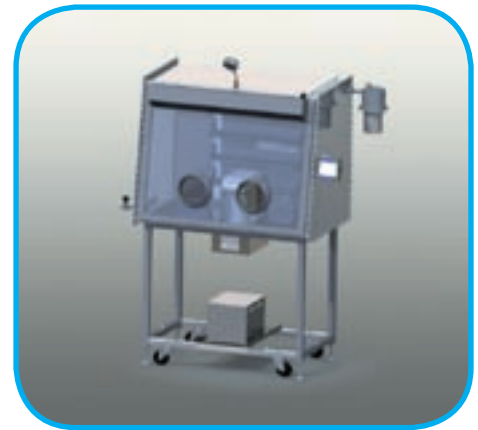
Q150GB mounted in a glove box

At the operational heart of Q150GB is a simple colour touch screen, which allows even the most inexperienced or occasional operators to rapidly enter and store their own process data. To further aid ease of use a number of typical sputtering and evaporation profiles are provided.