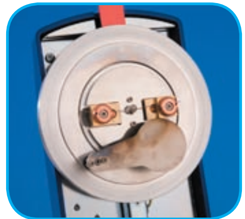
Metal evaporation head