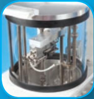
Carbon rod evaporation source. The height of evaporation sources can be adjusted using threaded terminal pillars