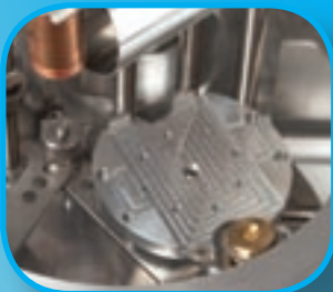
Specimen stage in position. The quartz crystal and holder of the optional film thickness monitor (FTM) locate into a recess in the stage and can be angled towards the evaporation source