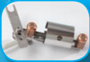
The standard metal source can be used to evaporate a range of metals from a suitable tungsten filament or boat. The terminals can also be used to evaporate carbon fibre. An adjustable source shield is fitted to help maintain the cleanliness of the system