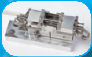
"Anti-stick" carbon evaporator source, designed to accept 6.15mm diameter carbon rods. Four springs maintain an even pressure during the evaporation process and ensure even, reproducible deposition