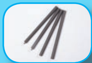
6.15mm carbon rods