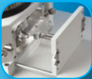
Rotary planetary specimen stage mounted on the sliding access drawer