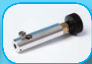
S8651 carbon rod shaper used (supplied with the K975X/K975S)